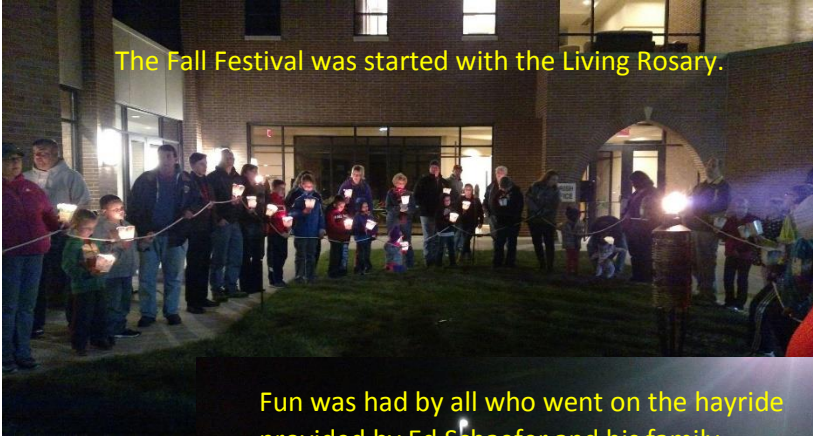
The Fall Festival was started with the Living Rosary.