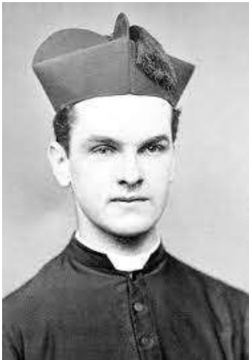
Blessed Father Michael J. McGivney August 12, 1852 – August 14, 1890 Beatified October 31, 2020 First Feast Day- August 13, 2021