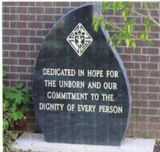
Monument to the unborn located at Gibault Catholic High School, Waterloo, IL.

We sponsor blood drives, participate in Columbia Daze and run the food stand. We support the July 4th Committee financially and operate a concession stand. We support the mentally challenged through our annual Tootsie Roll Drive. We conduct a diaper drive to support Loving Touch Pregnancy Care Center. We sponsor monthly card lotto for residents of Columbia Convalescent Center.